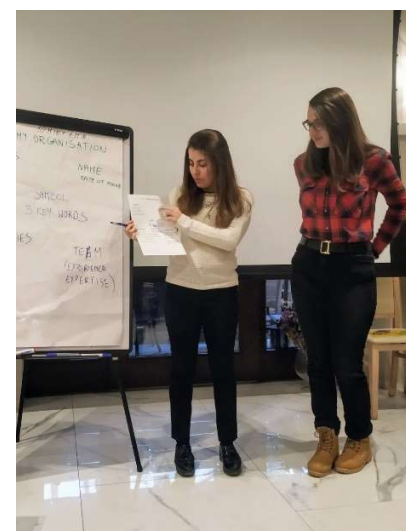
Please describing picture.

"... we gained through it a common viewpoint and many queries we might have had were answered."